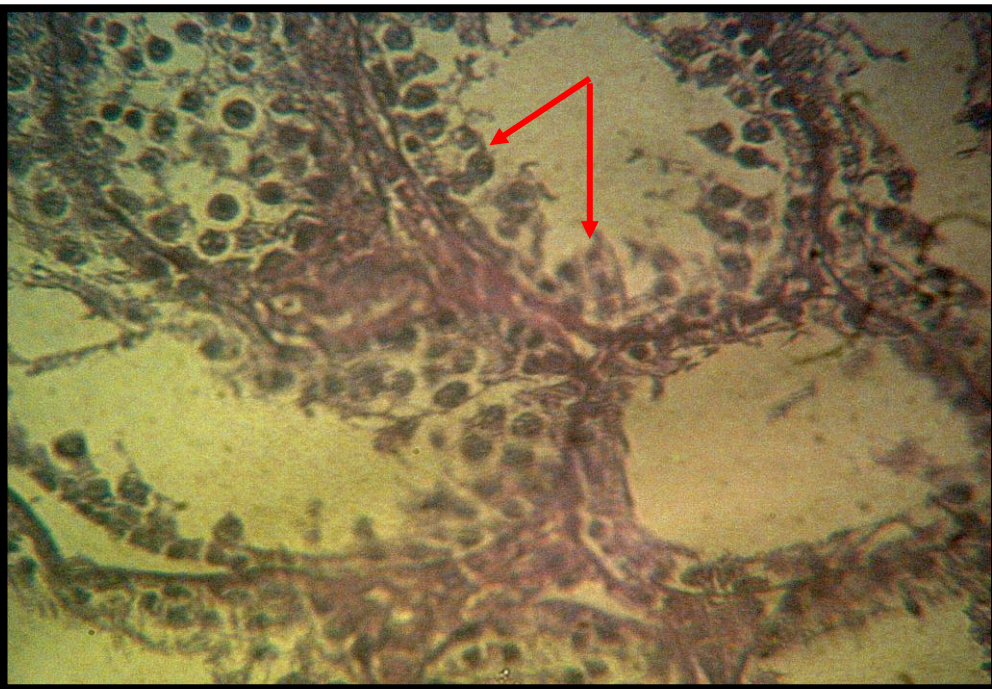
Fig (2) section in testes from cadmium treated rabbits (group II), note vacuolation of cytoplasm of Sertoli cells and degeneration of spermatogenic cells (H & E. 400X)