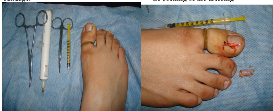
Figure No.1-A: Before surgery

Their ages ranged between 16 and 38 years with a mean+SD of (26±10.3years). Seventy seven patients were females, six of them had both sides disease and thirty five males, two of them had both sides disease. Sixty percent were in stage- III, 27% were in stage- II and 13% were in stage- I (table 1). Under local anesthesia, a rubber band is applied to the big toe as a tourniquet, 1/5 th of the lateral nail plate is removed. The matrix area is exposed by performing a 1/2 cm incision at the corner of the affected nail. Any granulation tissue is curetted and cauterized and so the matrix area, using a Cordless pencils electrical cautery.(MEDI Choice-Owen and Minor Richmond, VA). The incision is sutured with 3(0) silk and the procedure is terminated by removal of the tourniquet, dressing is done with Chlorhexidine sterile Gauze impregnated with white soft paraffin and covered by povidone- iodine Soaked gauze wrapped by bandage.