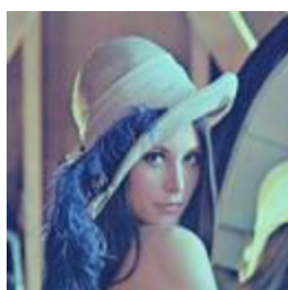
Figure (3) original Lena 128 × 128