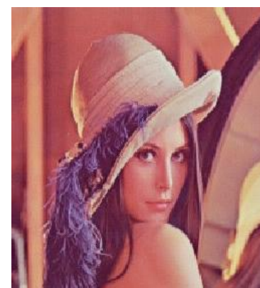
Figure (4) original Lena 256

on the data, we must choose an appropriate quantization formula and factors.