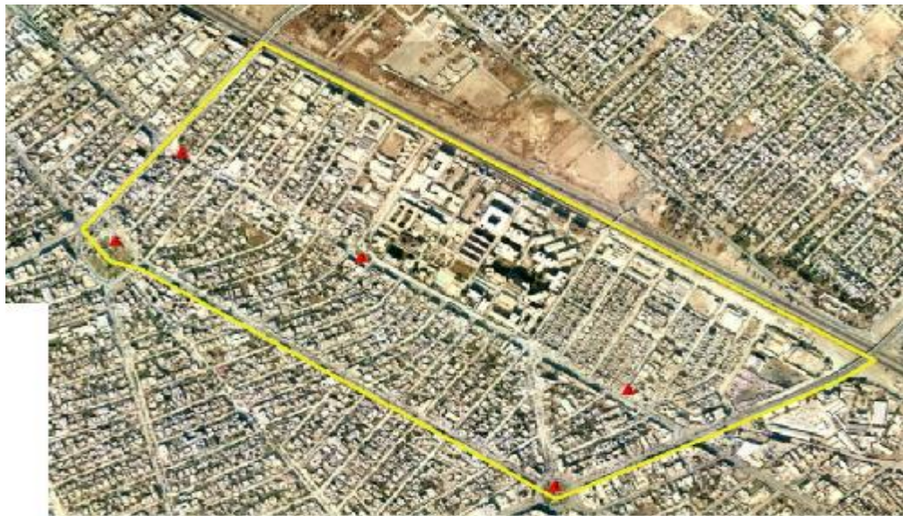
Figure (2): The GCPs distribution in study area.