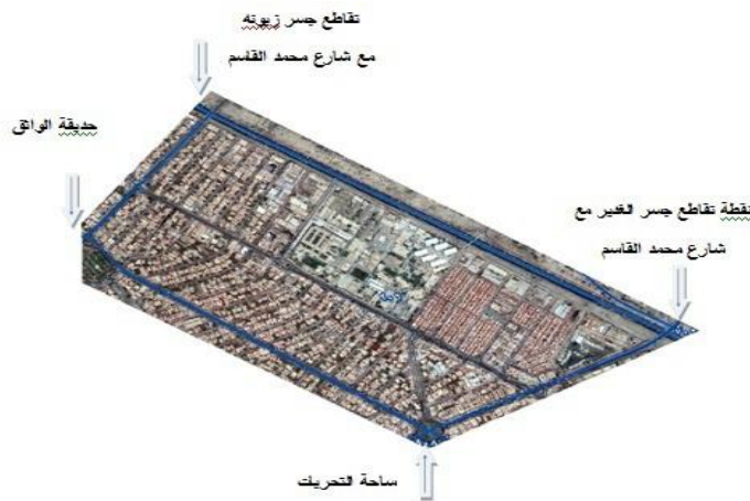
Figure (1): The study Area

The study area divided to twenty sector and each sector consist of about five blocks, each block consist of about thirty (30) houses, which means that the Mahala of our study area include about 3000 houses, so that the population estimation of Mahala 906 are about 10000 persons.