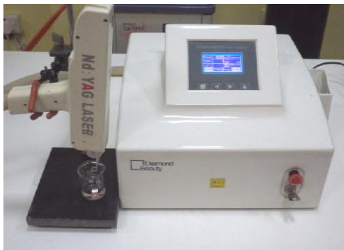
Figure (1) Experimental setup for nanoparticles synthesis by PLAL.

It can be seen that the state of plasma plays a basic and decisive role in such instantaneous formation mode. Morphology is controlled by laser energy, and this has an effect on the state of plasma, especially the lifetime and intensity of plasma [17]. In case of low laser energy figure ( 3-a,b) the plasma plume is weak and has a relatively low temperature and pressure. In addition to space distribution of laser energy and environmental disturbance, inhomogeneous density distribution in plasma plume becomes more obvious.