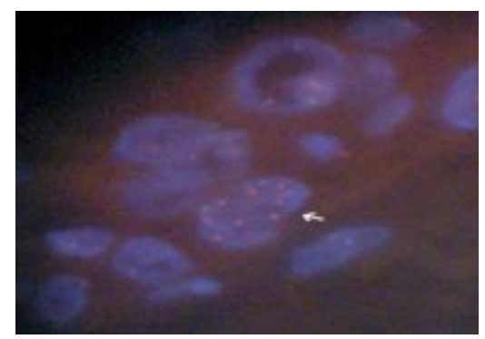
Figure 1: Positive HER2/neu amplification signal in well differentiated OSCC. (100X) Arrow: 2green dots and multiple red dots for the amplification.

between two markers. P value from 2 sided tests was used to determine significance, with a P value < 0.05 indicating statistical significance.