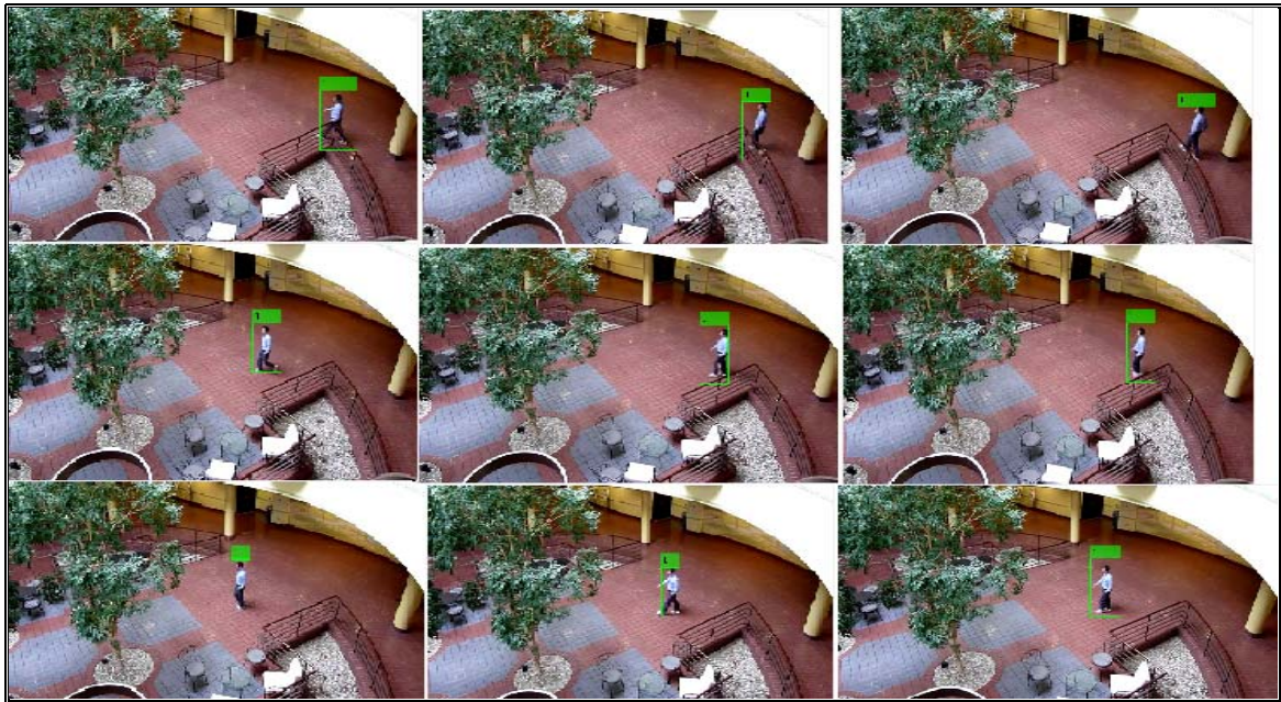
Figure (3): output frames from video-2