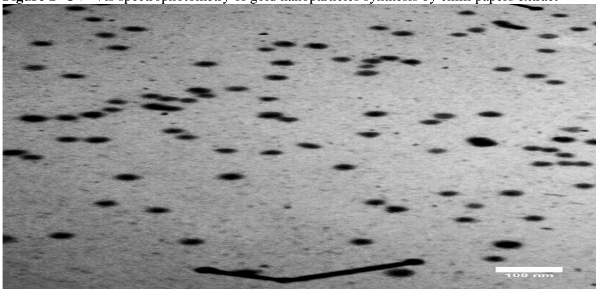
Figure 2- Transmission electron microscopic (TEM) images of Au NPs Synthesized using chilli papers extract.