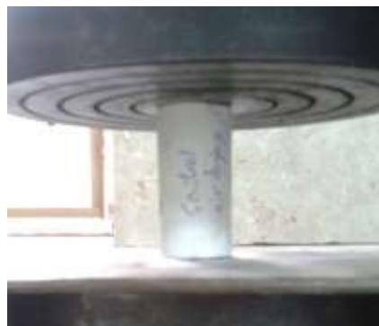
Fig. (2): Specimen under test