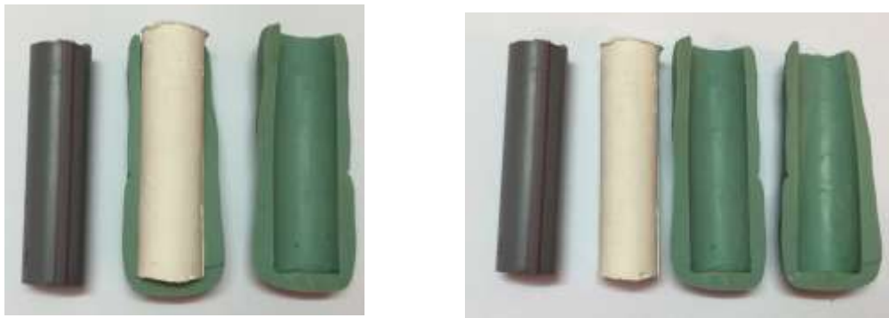
Fig. (1):Plastic pattern, plaster sample and silicone putty mould