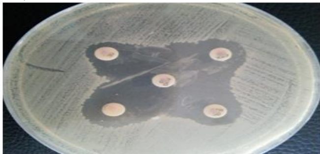
figure (1).Clearance the inhibition of producing of ESBLs due to clavunic acid through expansion of the zone of inhibition between AUG and each of CRO ,CAZ ,ATM and CTX.

The study revealed that E.coli was the most prevalent ESBL producing isolates 65.4%. This result closed to Al-Nammi (2001) in Baghdad (Iraq), who reported that (72.6%) of E. coli isolates gave positive ESBLs, while ESBLs producing K.pneumoniae represent 19.2% in present study this near from local study showed 10.5 % done by Al-Charrakh , (2005). Such result was less than the study in Erbil province 40 % by Ahmad and Ali,(2014).