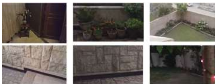
Figure (2): The Set of Background Images

This section illustrates the experimental results of the proposed foreground object detection method. A set of digital color images with different size and type have been used as test materials to evaluate the proposed approach performance. Figure (2) presents the set of used background images, figure (3) presents the set of used current images, figure (4) presents the result in binary (when apply threshold in matching measure M(i,j) if is true set 255 (white) otherwise set 0 (black)) for the detecting foreground objects by applying the proposed method and figure (5) presents the result in color (when apply threshold in matching measure M(i,j) if is true set its color value otherwise set 0 (black)) of foreground objects detection by applying the proposed method.