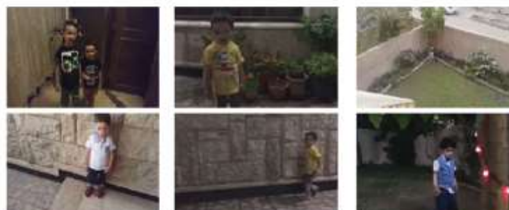
Figure (3): The Set of Current Images