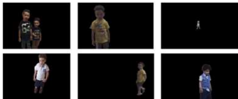
Figure (5): Color Foreground Objects Detection Using Proposed Chrominance and Texture Features with Enhancement by Canny Filter

According to figures (4, 5) illustrate that the results of detection object are robust against obstacles like shadows, illumination changes, and noises when applying the proposed object detection method.