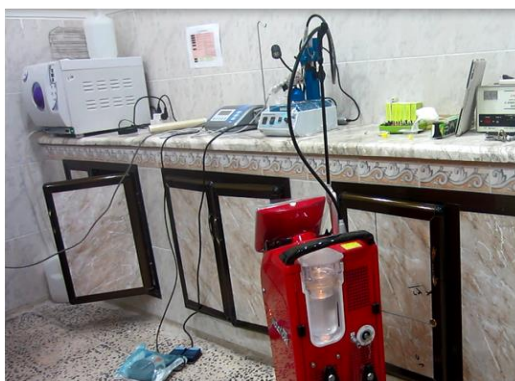
Figure (1) :Field of working area include laser with micro motor