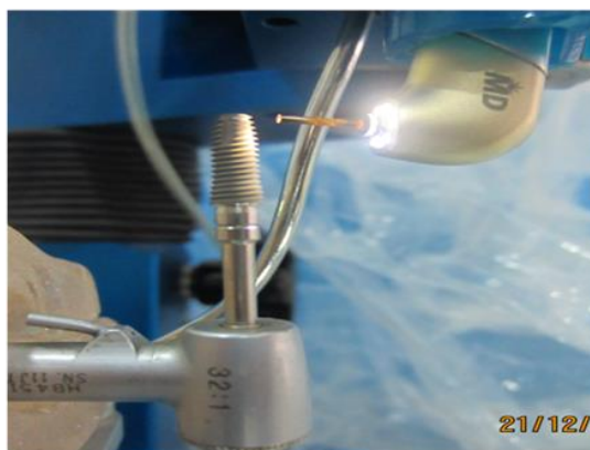
Figure(2)Position of fixture during laser exposure

tube that terminates in gold hand piece type with MZ10 tip (1mm diameter). The beam spot size at the tip was 1mm, and the exposure time was 30s for each thread at speed 25 RPM and the distance between implant and tip of laser is 2mm Figure.(2).