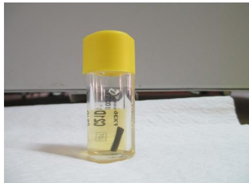
Figure(3):Dental Implant in a plastic container with the bacterial solution.

vial. The vial shook well manually in vertical direction, the final dilution of inoculated broth become 4 \times 10^7 CFU/ml (18) . Then for purpose of bacterial count, the bacterial suspension was added to 4 ml of normal saline and this incubated broth placed inside the container of the sterile implant to the level of neck of implant and then incubated at 37c for 18h this will lead to fixation of bacteria inside the rough surface of implant Figure.(3) (19)