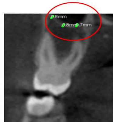
Figure 2: The cortical thickness of the inferior wall of the maxillary sinus

If the root apex is in contact or penetrate the maxillary sinus, the thickness is given value of 0.00 mm (14) . Measuring MSF cortical bone thickness in the region closest to the upper posterior root apices and in the furcation areas (Figure 2).