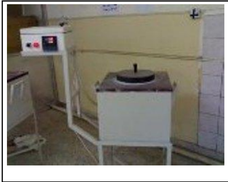
Fig. (1) Electrical furnace used for production castings.