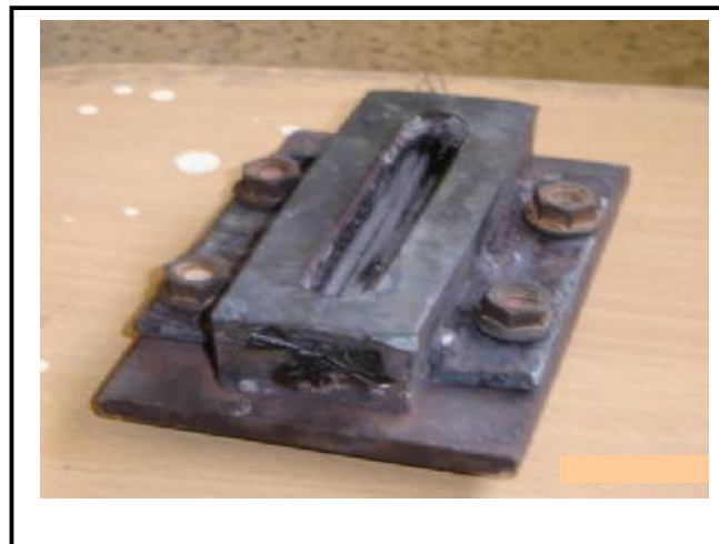
Fig. (2) Carbon steel die.