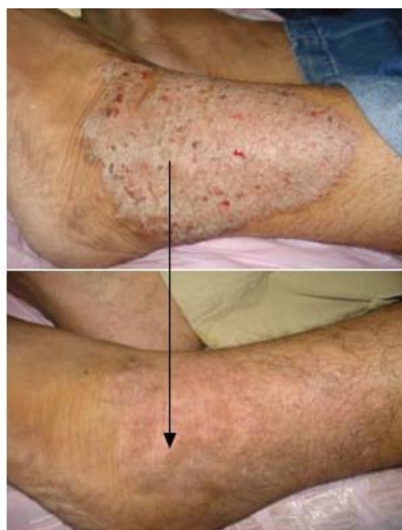
After treatment steroid therapy