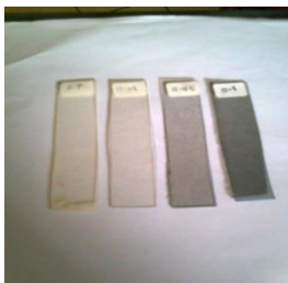
(a) Samples for bending test

Hand Lay-up technique has been used to prepare sheets of composites. Amount of Epoxy was mixed with carbon nanotube in different weight percentage (0.01, 0.05 0.1)% by weight the samples. The dimensions and of cavities were made according to the size and shape of the samples as per ASTM D790 [9] standards for bending test, according to ANSI/ASTM D638 [9], for tensile testing, and ASTM-E10[10], for hardness test.