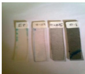
(b) samples for tensile test