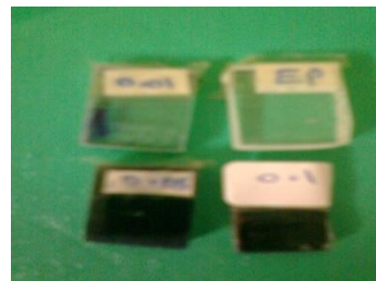
(c) samples for hardness test