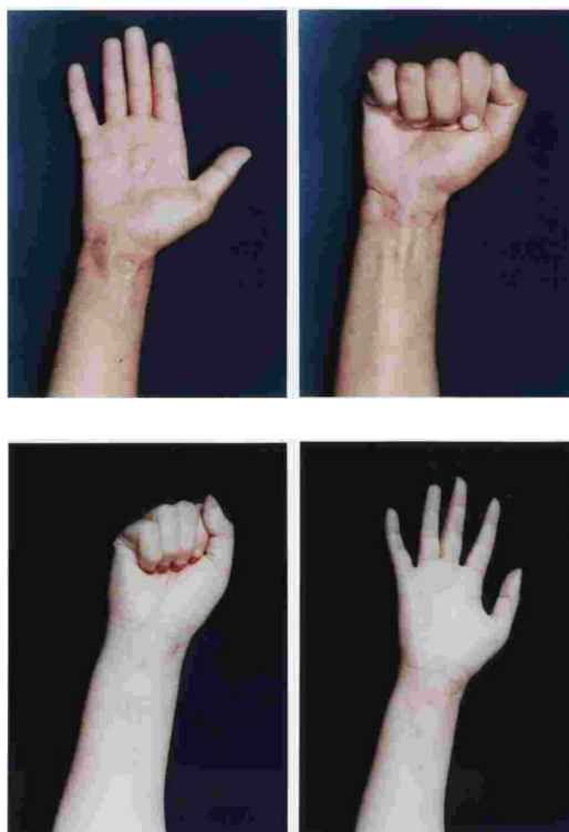
Figures 1&2. Repair of both tendons in zone V

Our results confirm that immediate primary tendon repair (especially at