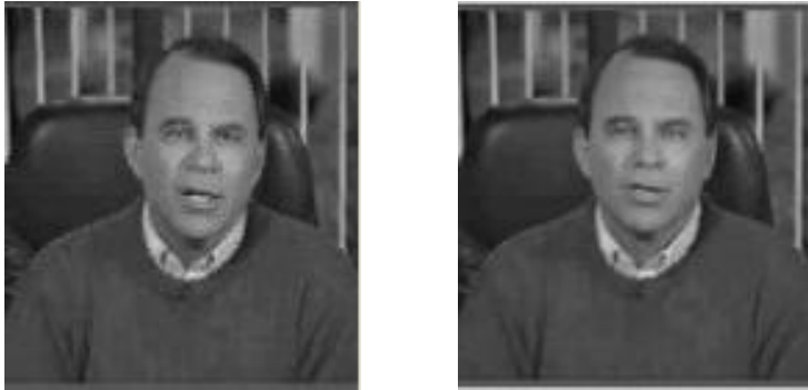
Figure 3- The origin (Man) image(I),(P).