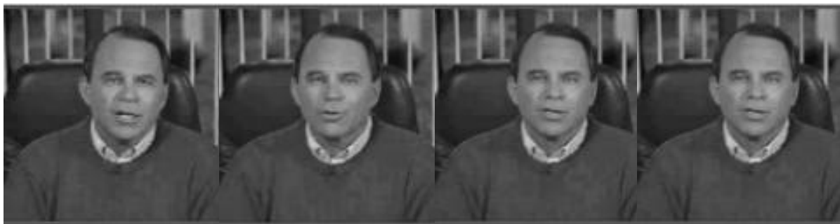
Figure 6- Frames (I), (B1),(B2) and (P) respectively Where BB-pictures are bidirectional predicted both from the previous decoded ( I ) and P-picture.