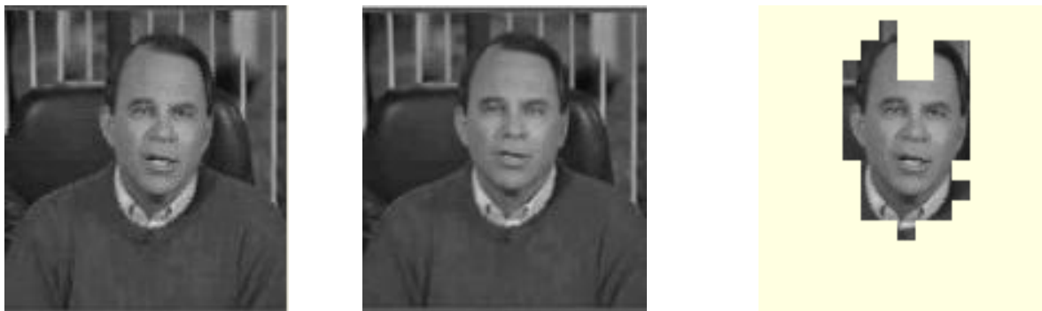
Figure 5- Reconstruction image (I), and (P) when we apply block truncation applied for man The number of block difference 55 if select thr. 12 using MAD