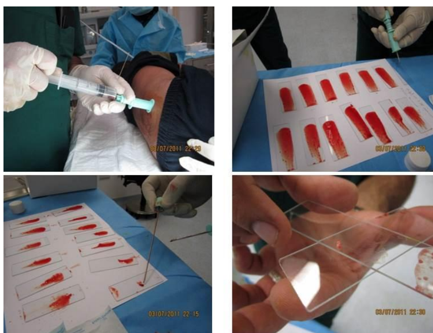
Fig. 1: Bone marrow aspiration and trephine biopsy procedures to one of the study cases, showing the way how to spread marrow smears and how to make marrow touch imprint from the biopsy piece.